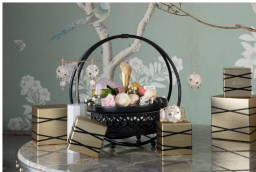
A Dream Paradise Afternoon Tea