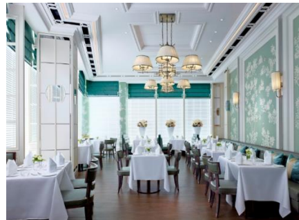
Gradini Ristorante E Bar Italiano