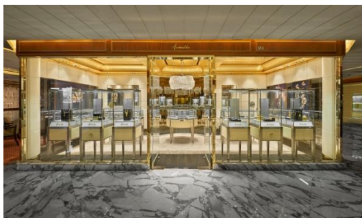
Annoushka Mandarin Oriental Boutique