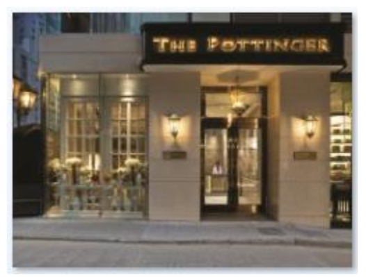
The Pottinger Hong Kong

For a detailed explanation of how Forbes Travel Guide compiles its Star ratings, click here.