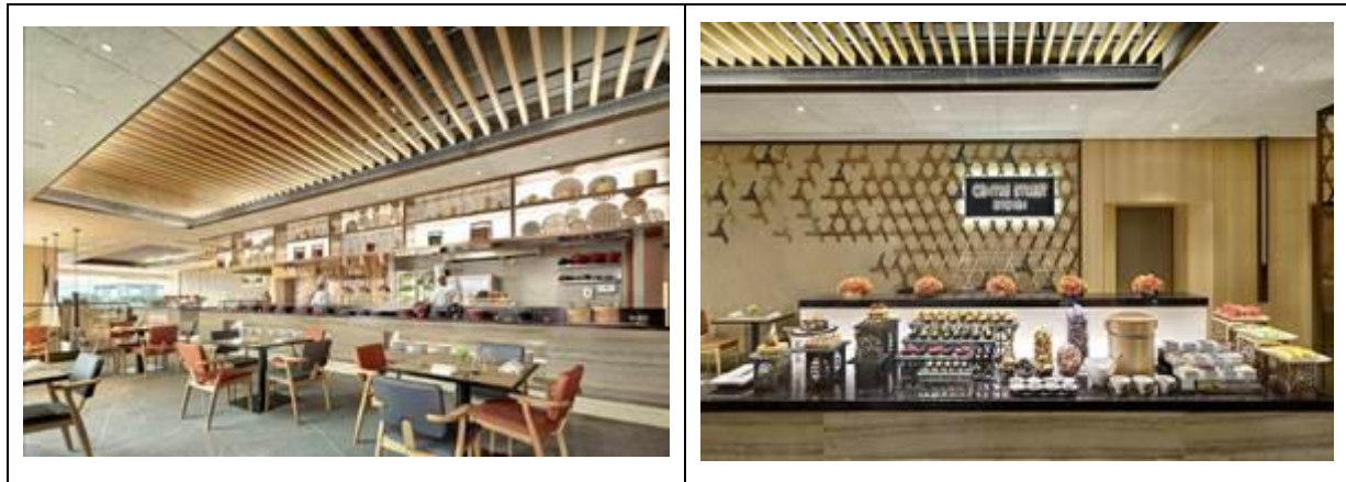
Centre Street Bar – Interior Shots