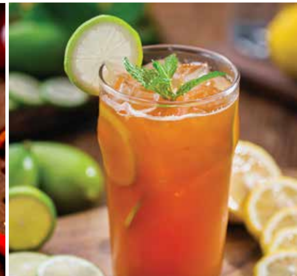
Promotion photos are for reference only 宣傳圖片只供參考